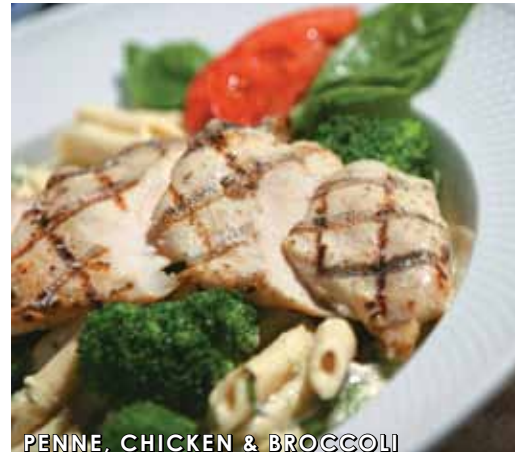
PENNE, CHICKEN & BROCCOLI

Juicy fresh grilled chicken, broccoli florets and penne pasta blended with roasted garlic basil cream sauce