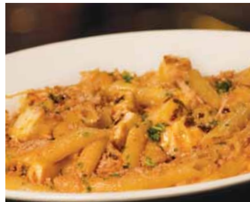
CHICKEN MACARONI & CHEESE

Chunks of tender grilled chicken tossed with creamy fontina and cheddar cheese mixed with penne pasta then topped with panko breadcrumbs