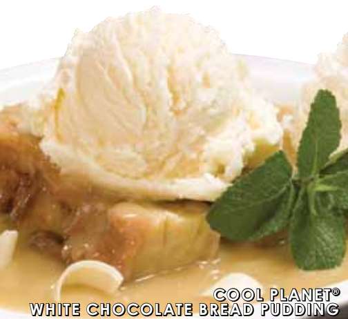
COOL PLANET® WHITE CHOCOLATE BREAD PUDDING