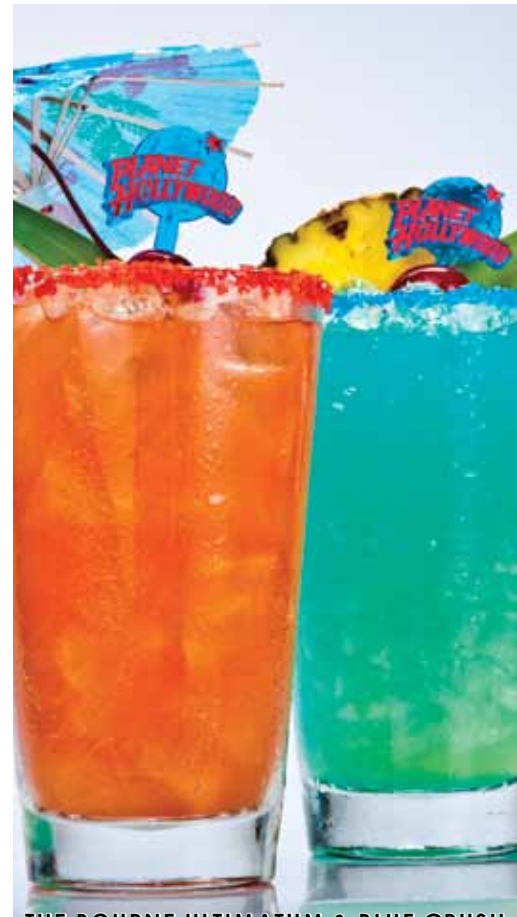
THE BOURNE ULTIMATUM & BLUE CRUSH

The Super Sour is a combination of Midori's sweetness with the bright lip puckering tartness of fresh lemon juice and sour. Rimmed with a tasty super sour sugar and Lemon Roxi Rox that will take your taste buds to a whole new level!