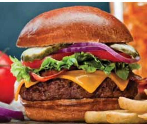
CELEBRITY BBQ BACON CHEESEBURGER