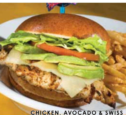
CHICKEN, AVOCADO & SWISS