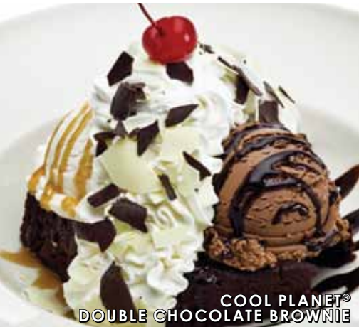
COOL PLANET® DOUBLE CHOCOLATE BROWNIE