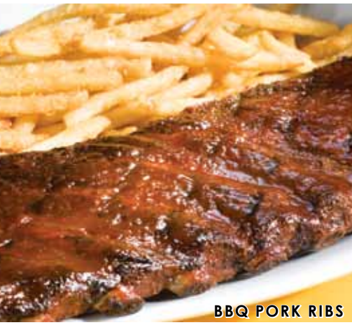
BBQ PORK RIBS

Tender hickory-smoked St. Louis-style ribs smothered with our tangy, sweet barbeque sauce and served with french fries