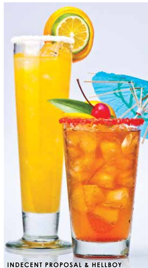
INDECENT PROPOSAL & HELLBOY