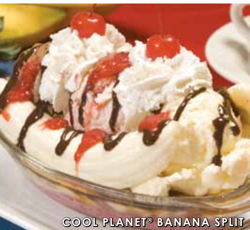
COOL PLANET® BANANA SPLIT