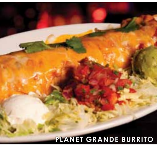
PLANET GRANDE BURRITO