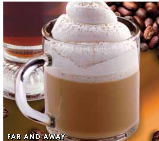
FAR AND AWAY