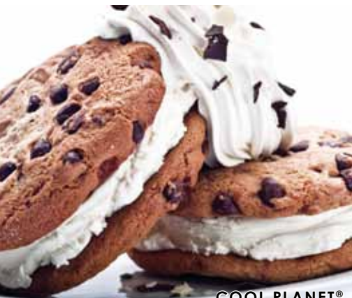
COOL PLANET® ICE CREAM SANDWICH