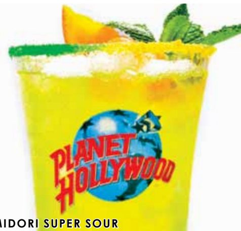
MIDORI SUPER SOUR