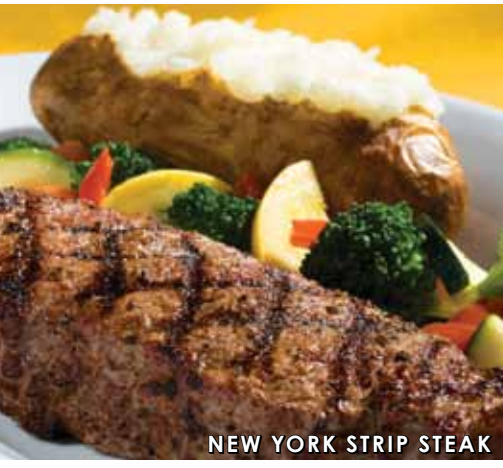
NEW YORK STRIP STEAK